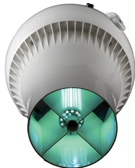
Air Pear fan discharge outlet showing illuminated PHI cell

Factory installed broad spectrum HE/UV light targeted on a quad metallic target that produces hydroperoxides. Creates aggressive advanced oxidation atmosphere to kill 99% of bacteria, viruses and mold (surface and airborne) and kill 85% of VOCs and odors. The 5 inch cell is to be used with a short nozzle Air Pear or Designer Series model 10, 15 or 25. The 9 inch cell is to be used with a standard length nozzle Air Pear or Designer Series model 10, 15, 25 or 45.